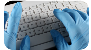
Tactile typing at the speed of a regular keyboard