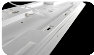
For use on wall-mounts/flip up keyboard trays