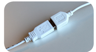
4-Directional Quick Disconnect Cable with Double Strain Relief