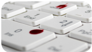
Easily detect contamination