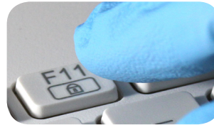
No need to disconnect during cleaning