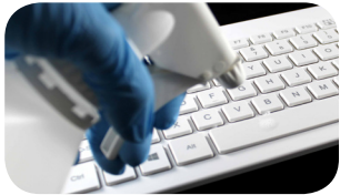
Wipe, Spray or Rinse