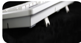
To use flat or tilted