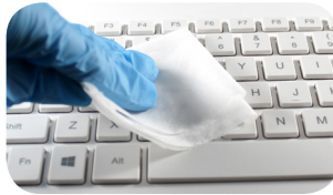
Use standard hard surface cleaners