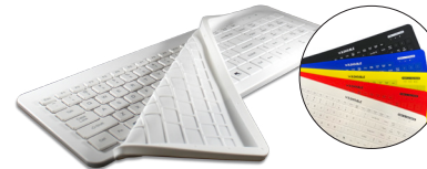
Very Cool w/ Fitted Drape