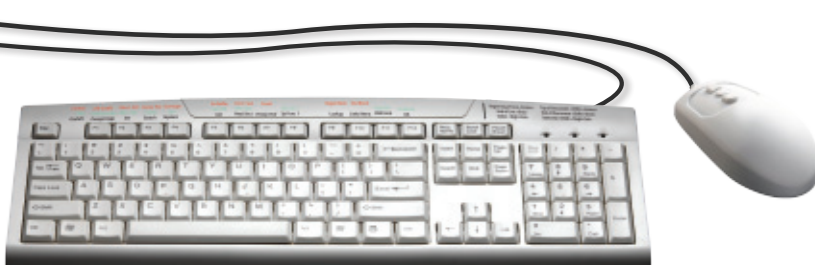
▲ U Cool M paired with a Man & Machine Mighty Mouse 5