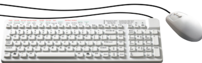
▲ Really Cool M paired with the Man & Machine Mighty Mouse 5